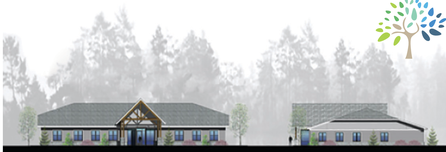
Future Christian Healthcare Centers Newaygo building, projected completion Fall 2021